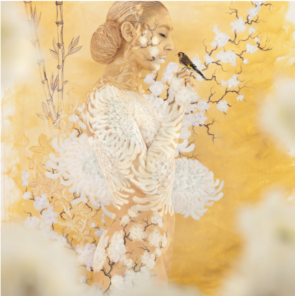
"Oriental Bouquet Cradled Finch - Utopia" by Emma Hack (Savina Museum of Contemporary Art)

Looking at the final images, it's hard to estimate how many hours have been put into the body camouflage painting they depict. But the work process is very labor-intensive, and requires the artist and the models to stand from eight to 15 hours. It takes a lot of patience for a model to stand still for many hours while the artist applies paint with brushes and checks to see that each brushstroke matches the wallpaper through the camera lens.