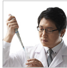
써보고 깜짝 놀란 기미잡티 솔루션

영어뉴스를 통한 Listening · Reading 실력 향상 단기 학습 프로그램 [NEST]