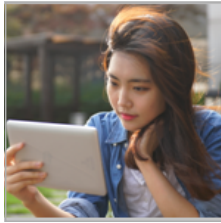
영어, 하루 30분 했더니 "이제 자막없이 미드봐요"