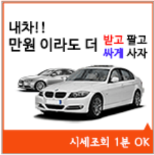
딜러거래가격오른 했다고 전 해라~