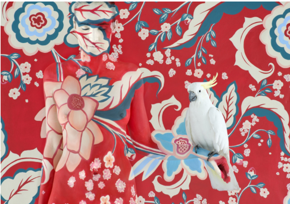
"Vreeland's Cockatoo - Birds of a Feather" by Emma Hack (Savina Museum of Contemporary Art)

For the opening of her Seoul show, Hack conducted a seven-hour live performance during which she recreated a lotus painting by the 18th century Korean painter Kim Hong-do with a Korean contemporary dancer on July 22 at the museum.