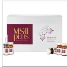
바르고 문지르면 기미, 잡티가 깨끗!