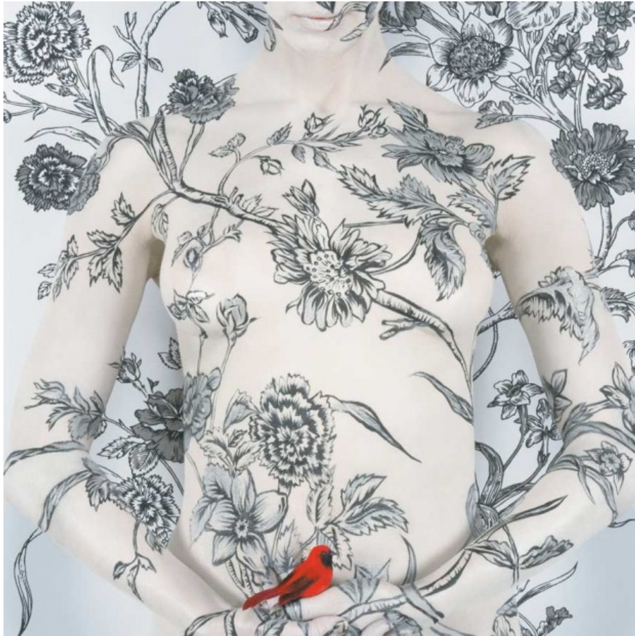
Red Bird III

Creating my first exhibition and calendar – a dream come true that launched my career and promptly put me in debt for 2 years!