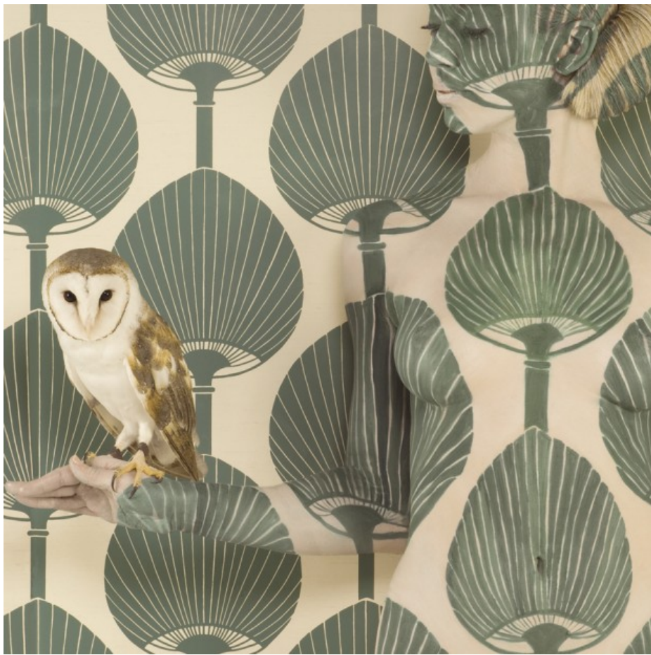
Wallpaper Owl III

7. What's the best piece of advice you've ever heard?