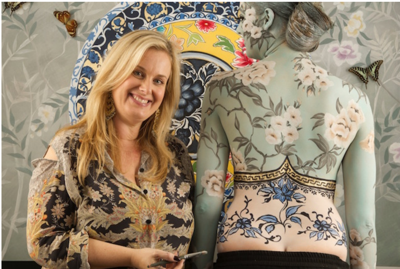
Emma Hack and body painting muse.

http://www.thecatstreetgallery.com runs August 25th to September 12th at The Cat Street Gallery in Hong Kong. The exhibition will also appear at Seaview Gallery ( https://www.emmahackgallery.com/pages/seaview-gallery ) in Queenscliff, Victoria, Australia later this month. Hack's solo museum exhibition, Body Flower ( http://www.savinamuseum.com/eng/index.action )—a retrospective of over ten years of her work—is now on at Savina Museum of Contemporary Art in Korea, and runs until October 30th.