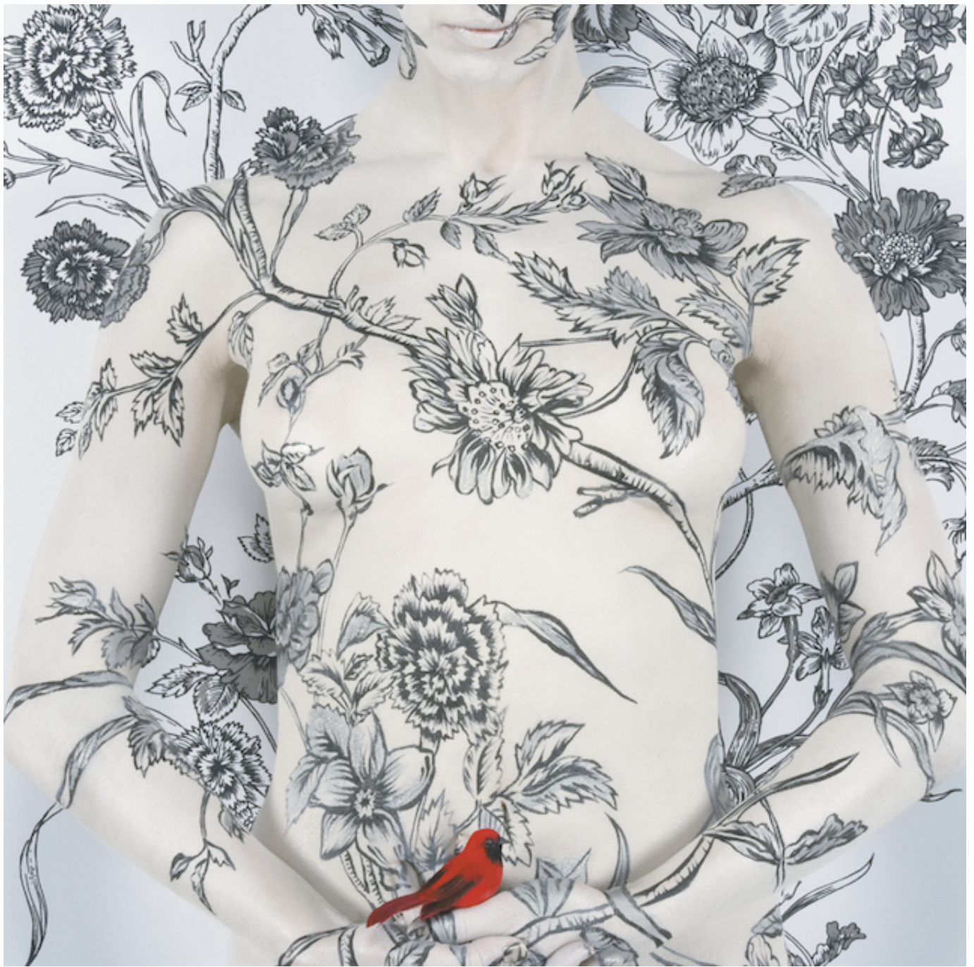
RED BIRD III