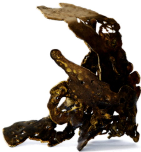
Storm Bronze 35 x 35 x 15cm

I would also LOVE to show in London, and in Paris, and in New York . . . life is long, I think I have time.