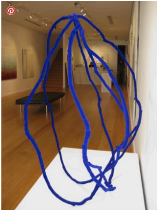
Big Blue Blood Plum Flocked Aluminium

A ballerina and then an artist – I've pretty much stayed on track. When I was 16 I moved from the country to study full time dance – I then went on to work professionally as a dancer for over a decade. I was always a maker of things and that interest eventually won out and I found myself at RMIT in Melbourne studying Sculpture. I then moved to Sydney for love (what better reason and a good move, 20 years and 2 boys later) and completed an MFA at COFA and have not stopped working as an artist since. I feel very blessed to have fulfilled both passions and continue to do so.