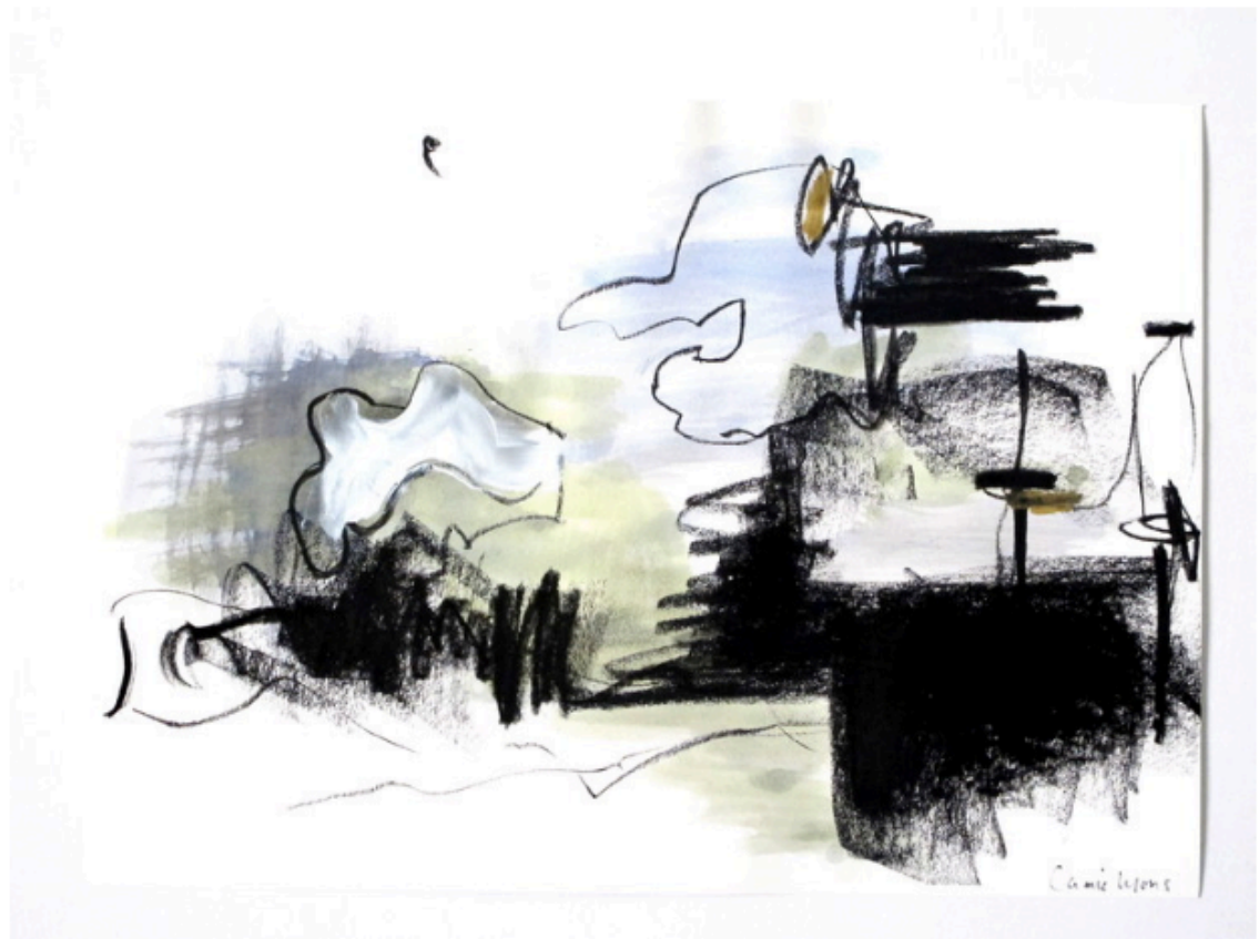
From Midnight Sketching series

My other proudest achievement is raising two fabulous little people with my husband. It's just us, we are a tight unit. They are experiencing a completely different childhood from my own, they have grown up surrounded by art and mess and travel. They have been dragged from pillar to post – literally from the Colosseum to the outback. I can only imagine the influence all this is having . . . time will tell.