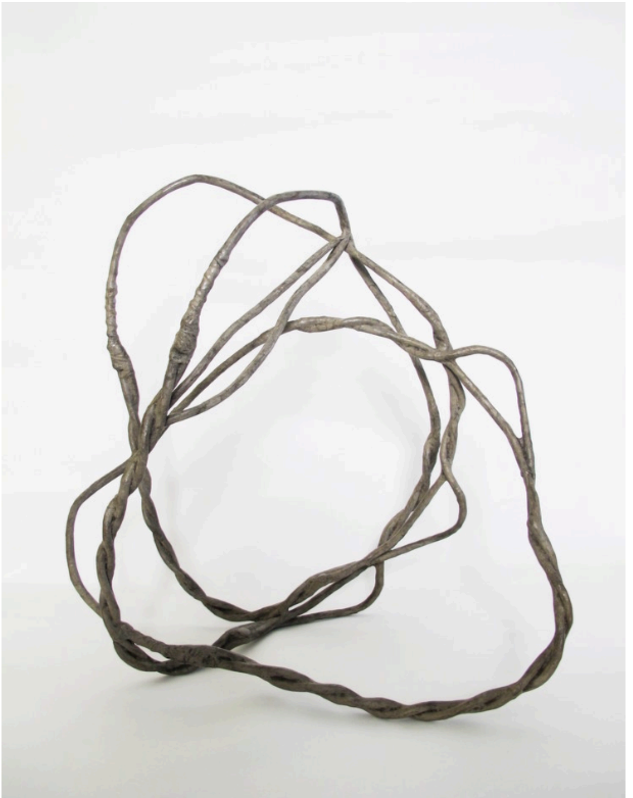
Many Mouths Bronze 60 x 60 x 35cm