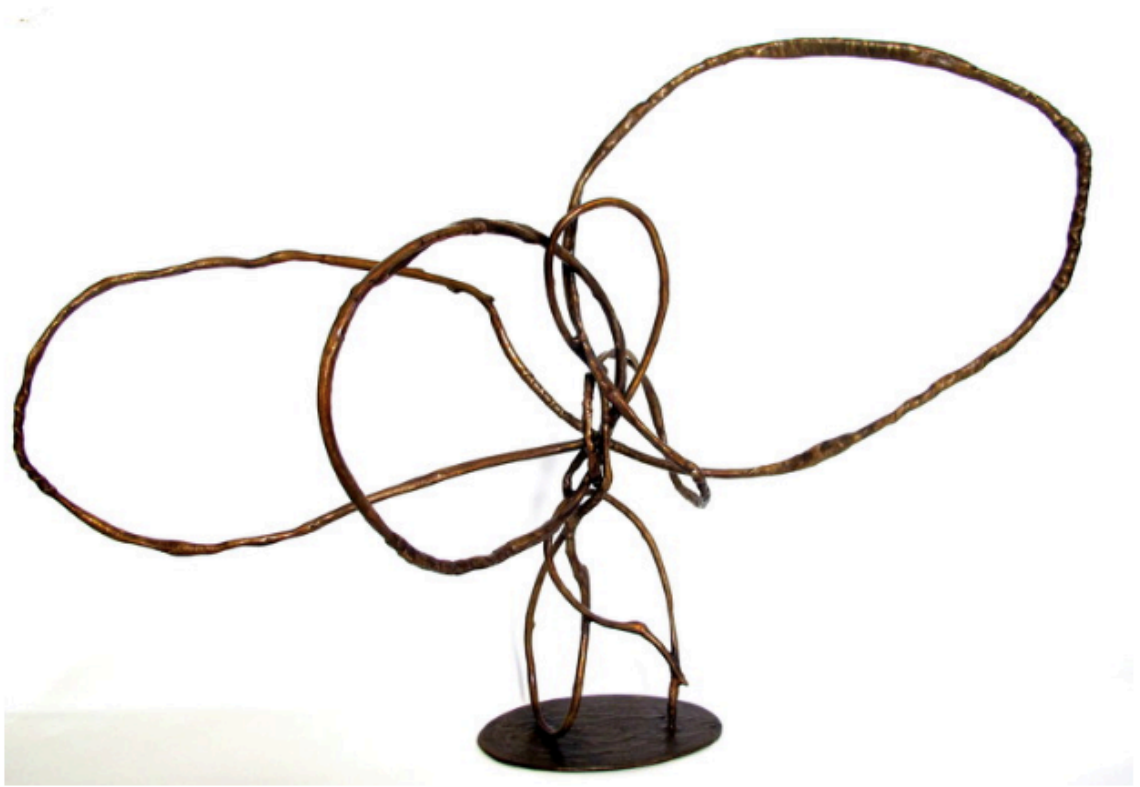
Continuous Drawing Bronze 99 x 70 x 28cm

I drink too much, I worry too much, I am overly sensitive – sound familiar?!