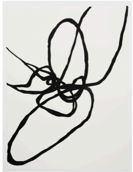
Pollenate Charcoal and ink on paper 56 x 76cm