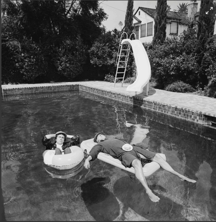
Comedians Peter Cook and Dudley Moore relaxing in a Beverly Hills swimming pool while in costume as the characters Pete and Dud, 1979.