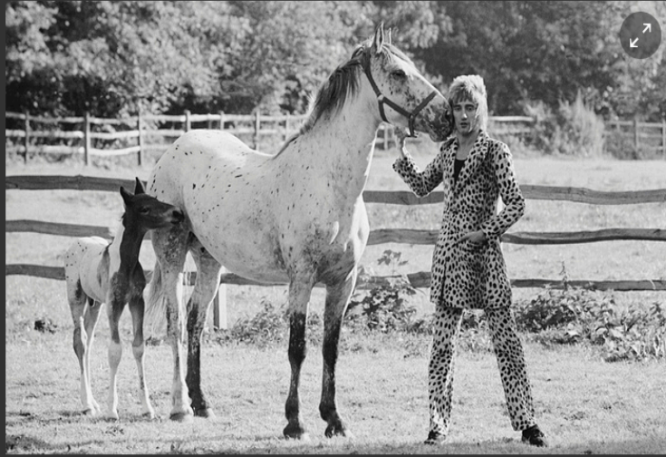
Rod Stewart poses in a leopardskin suit with a horse and foal at his home in Old Windsor, 1971.