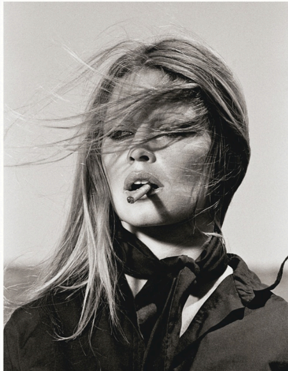
Brigitte Bardot whilst filming The Legend of Frenchie King in 1971.