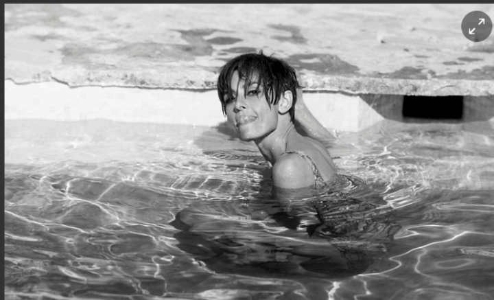
Audrey Hepburn takes a break from filming Stanley Donen's 1967 film Two for the Road.