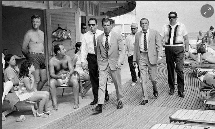
Frank Sinatra on the boardwalk at Miami Beach, during the filming of Lady In Cement, 1968.