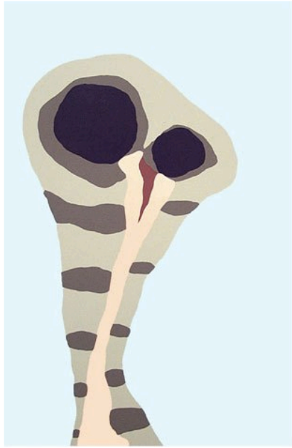
'upside down you turn me' 2004

Doublethink Exhibition runs from September 10th – October 10th 2014 at The Karen Woodbury Gallery in Flinders Lane, Melbourne. Opening night is Wednesday 10th September 6–8pm.