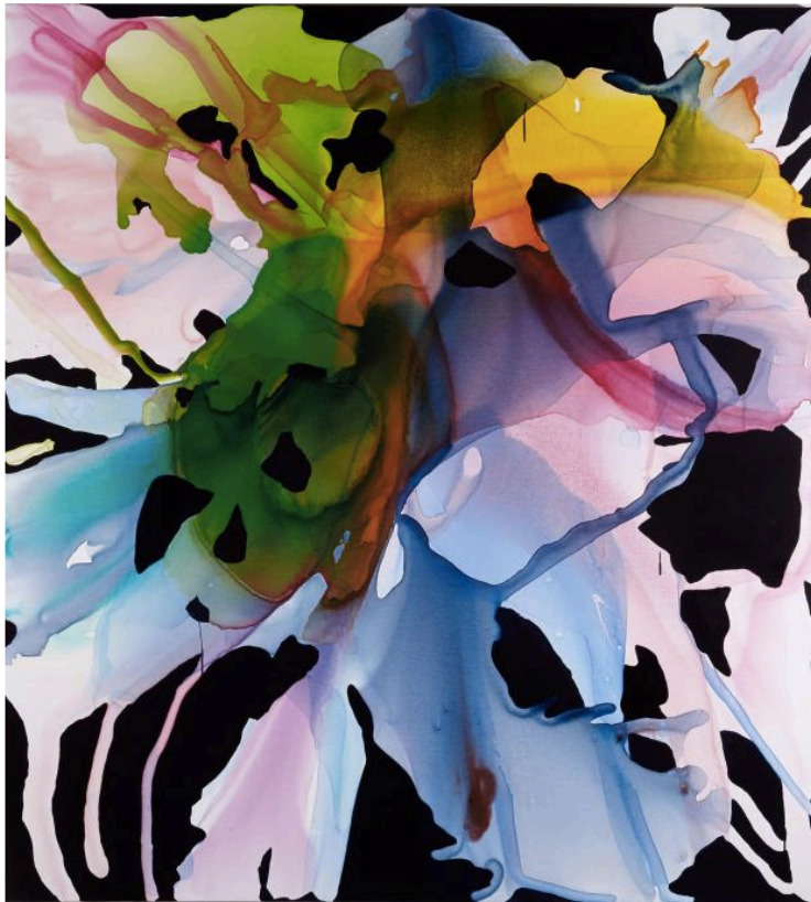
'the ever changing nature of things' 2013