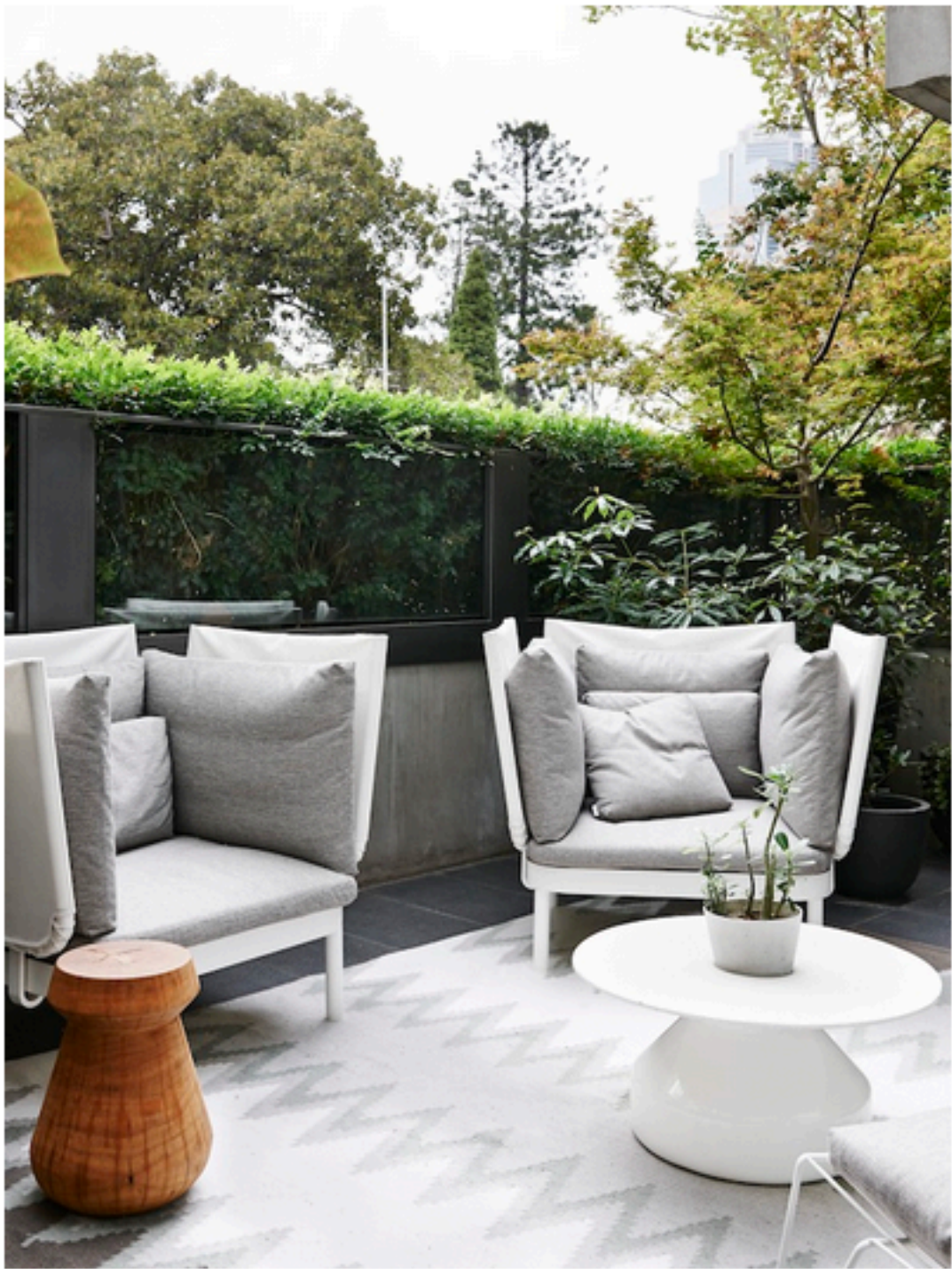
Outdoor terrace.