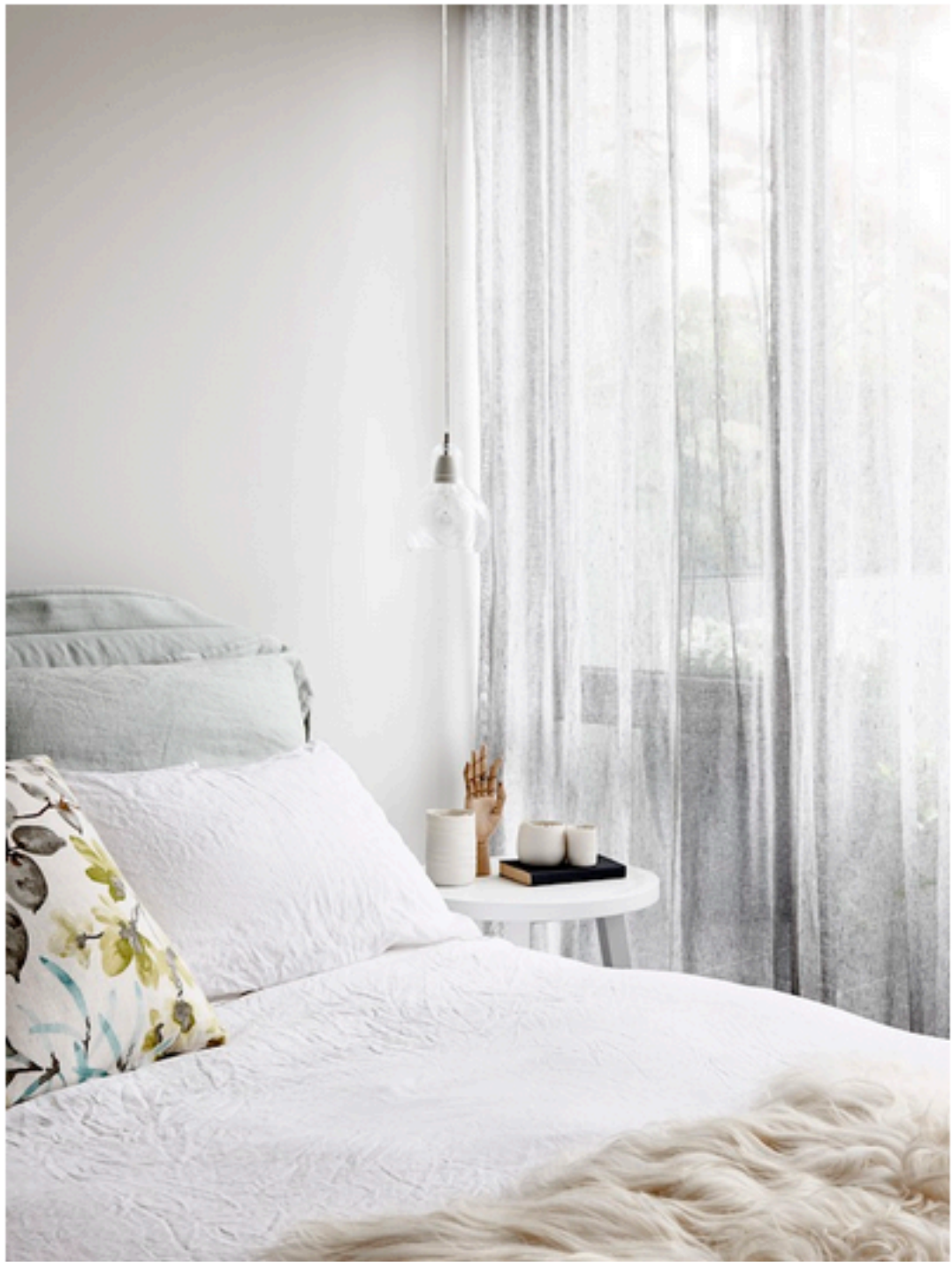
Bedroom details.