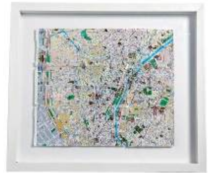
MAP OF PARIS I kept this paper map from the trip when we got engaged – the spot is marked.