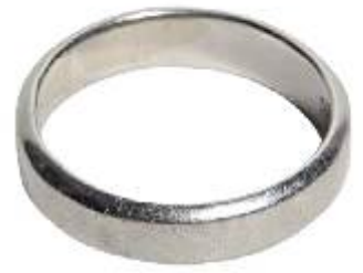
WEDDING BAND I made both our wedding rings at Pine Street studio's metal workshop.