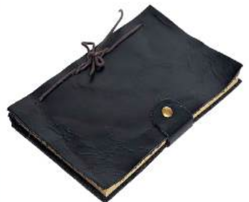
SKETCH BOOK I use this to sketch while I'm on holidays. I've framed a couple of my drawings for display.