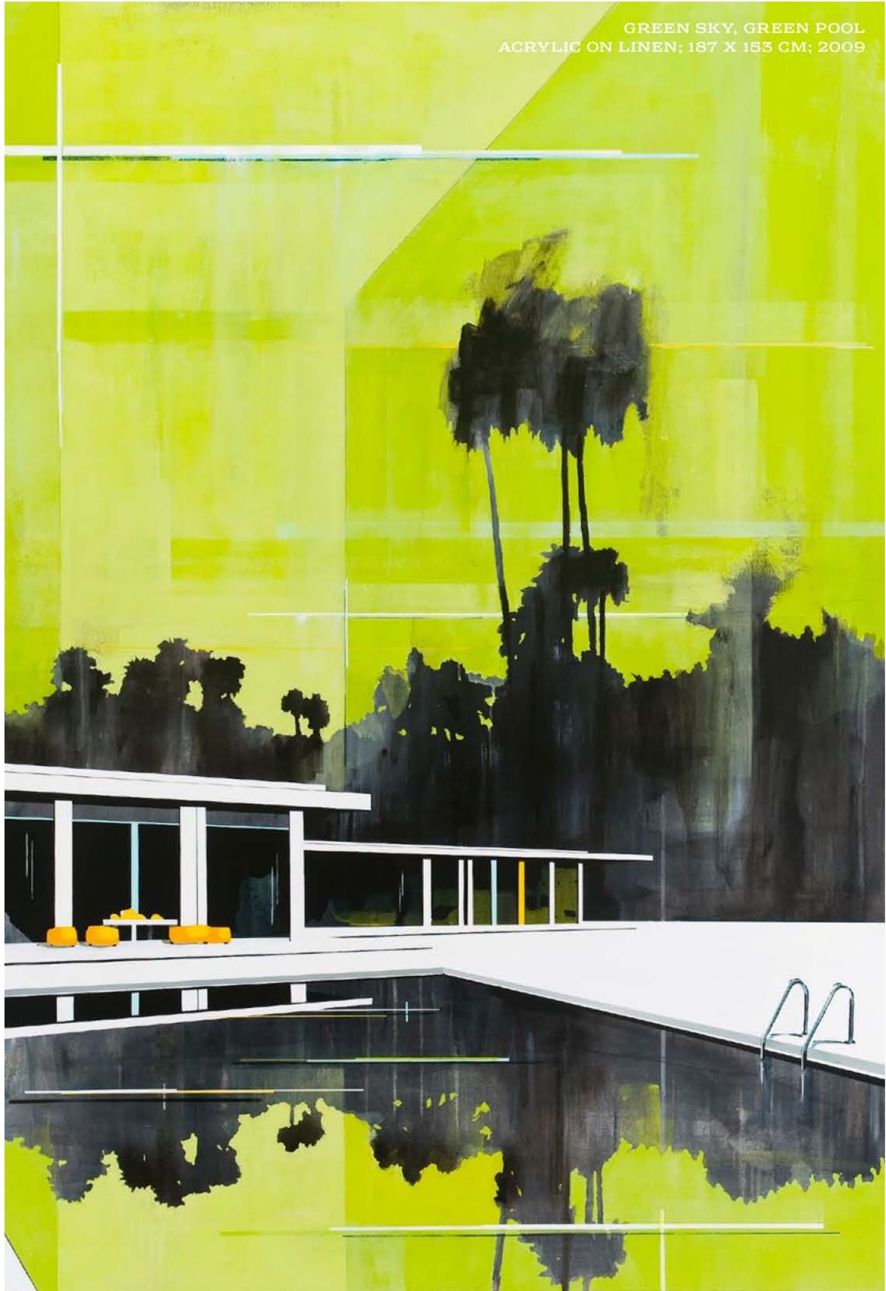
GREEN SKY, GREEN POOL ACRYLIC ON LINEN; 187 X 153 CM; 2009