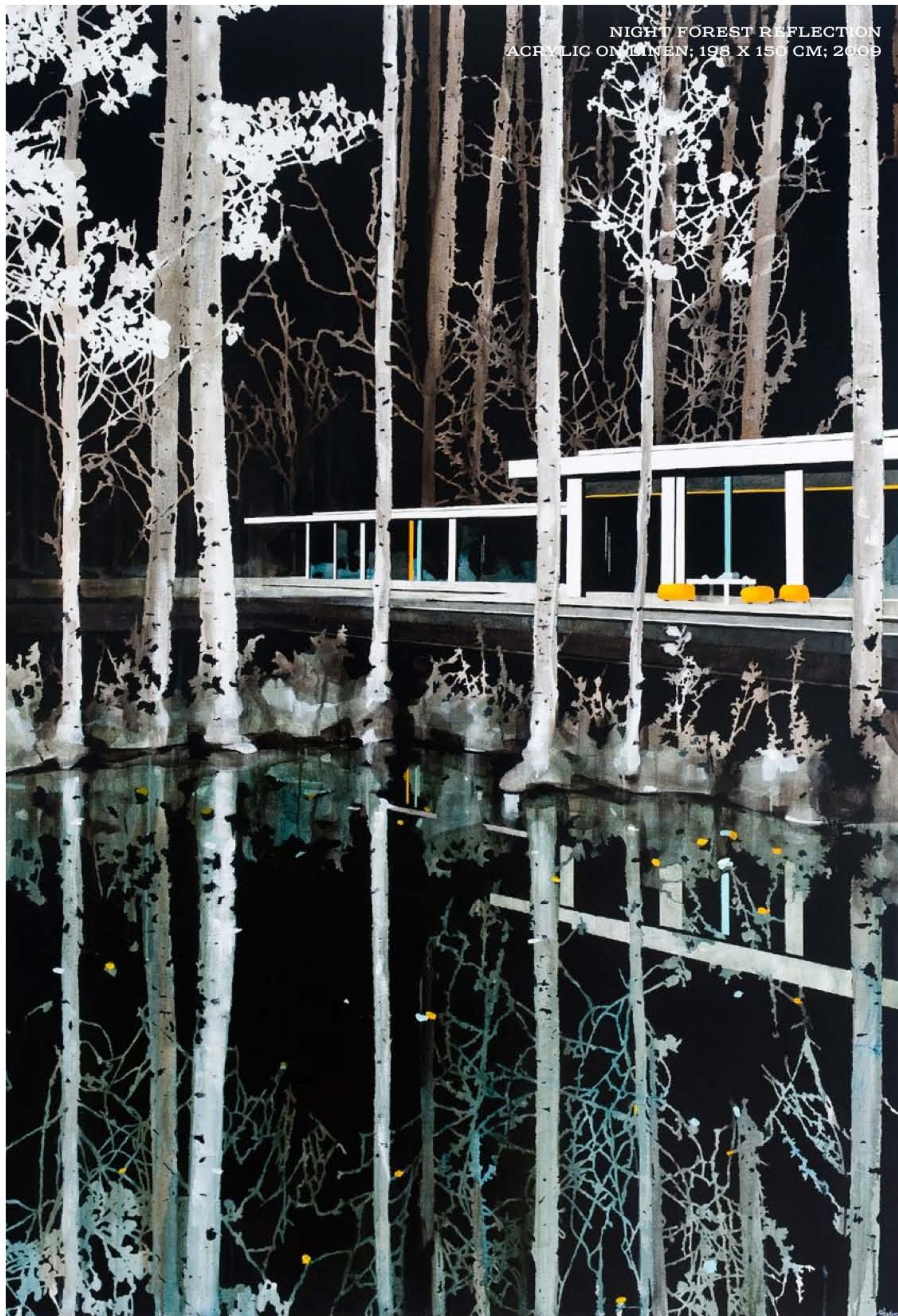
NIGHT FOREST REFLECTION ACRYLIC ON LINEN; 198 X 150 CM; 2009