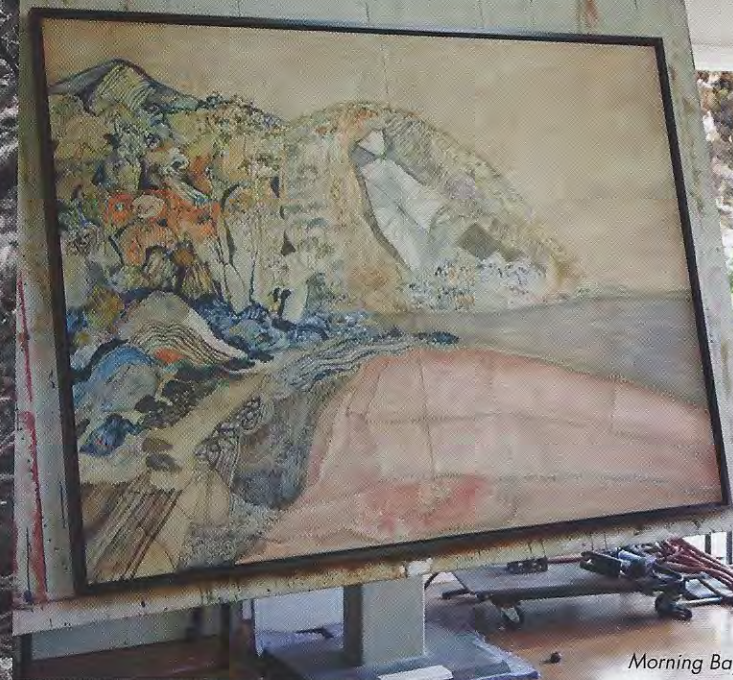
Morning Bay — Lovers Rock, 2010.